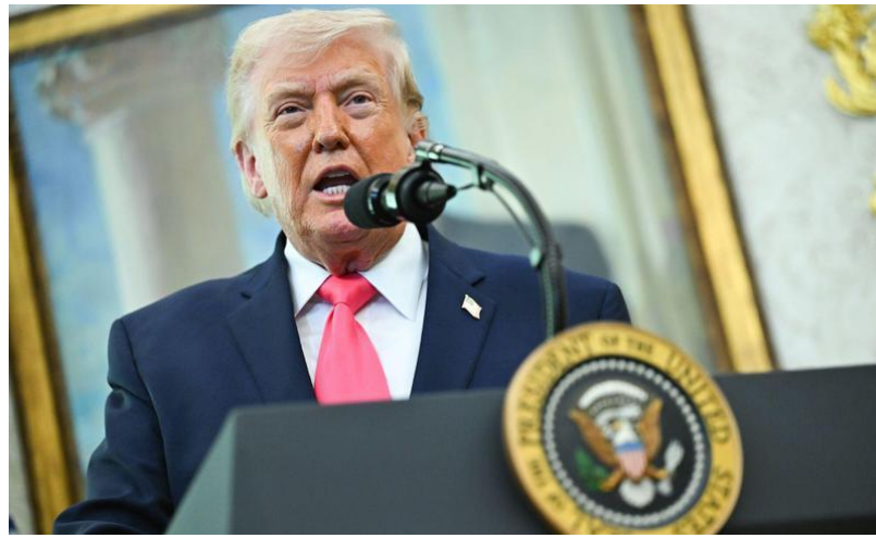
US President Donald Trump says the US is making progress in talks with Iran, even as Teheran denies that direct negotiations have taken place.

"We're waiting to see what happens with these US-Iran peace negotiations. Until we get some more clarity one way or the other, we