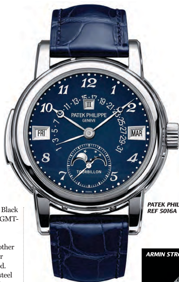
PATEK PHILIPPE'S REF 5016A

The lowest was US$14,000 for a red gold smart watch which Frederique Constant contributed. This also made it the lowest bid in the Only Watch auction, though the final price fell within the US$8,000-15,000 estimate for the watch. ■