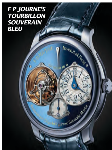
F P JOURNE'S TOURBILLON SOVERAIN BLEU