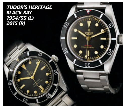
TUDOR'S HERITAGE BLACK BAY 1954/55 (L) 2015 (R)