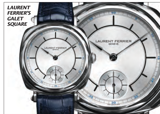
LAURENT FERRIER'S GALET SQUARE