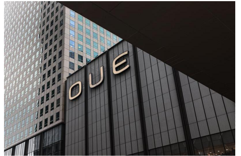
Analysts maintain their buy on OUE Reit on its strong Q1 performance and potential for value creation from its acquisition of Salesforce Tower in Sydney.

She noted that rental growth for the Sydney CBD market is expected to remain supported by investor "flight-to-quality trends and limited new supply beyond 2027". The Reit is also exploring the divest-