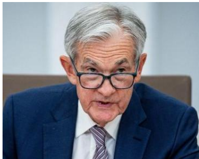
US Fed chair Jerome Powell says it is too soon to know the scope and duration of the economic impact from the war.

The yen was down 1 per cent against the greenback to 159.30 per dollar. It was set to gain 0.24