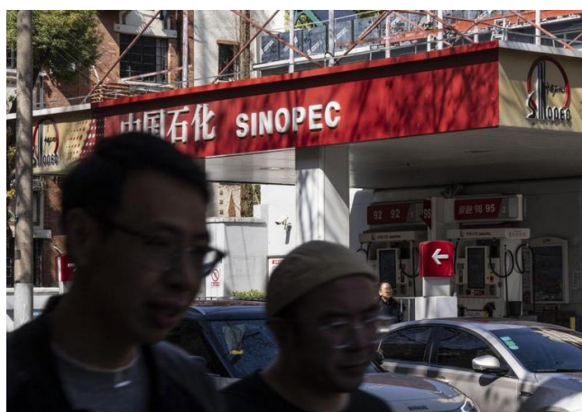
Sinopec forecasts that refinery throughput will remain stable at about 250 million tonnes in 2026.

ital spending from 131.6 billion to 148.6 billion yuan this year, including 72.3 billion yuan for exploration and development, mainly for crude oil capacity expansion at Jiyang and Tahe, natural gas capacity projects in western and southern Sichuan, and oil and gas storage and transport facilities.