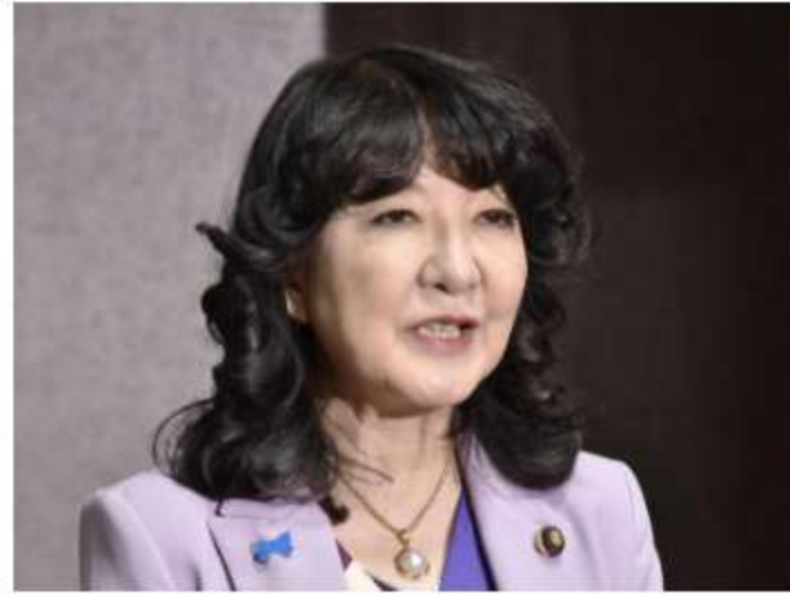
Japanese Finance Minister Satsuki Katayama says the time to take "decisive" action in the market is nearing. The dollar/yen was down after her remarks.