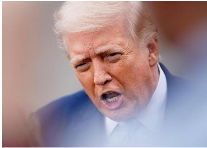
Trump made the announcement on Truth Social just hours before a deadline he had set for Tehran to "fully open" the Strait of Hormuz.

positive, it is only strikes on energy infrastructure that have been ruled out at this stage, presumably meaning that kinetic action will continue elsewhere, at least for the time being," he said.