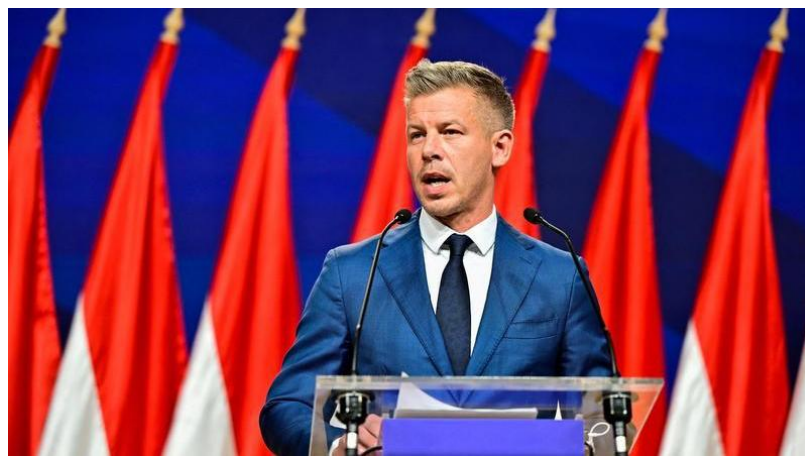
The Hungarian forint surged after veteran nationalist leader Viktor Orban lost power to Peter Magyar's (left) Tisza Party in Apr 12's national election after 16 years in office.

Brent crude futures were up about 7 per cent on Monday to