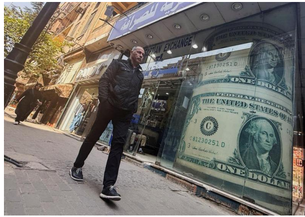
The US dollar index rose 0.1% on Tuesday to 99.293 after dipping 0.4% to near a two-week low on Monday.

National Australia Bank. Trump's track record for unpredictable policy has kept markets wary, and traders were uncertain whether he had begun genuine negotiations or only retreated from volatility-inducing threats, Catril added. Survey data on Friday showed early signs that the war was starting to impact the global economy. Business activity in the eurozone and Britain fell to multi-month lows, suggesting Europe was already suffering economically from the conflict. The euro was last down 0.2 per cent against the US dollar at US$1.1593 after gaining 0.4 per cent in the previous trading ses-