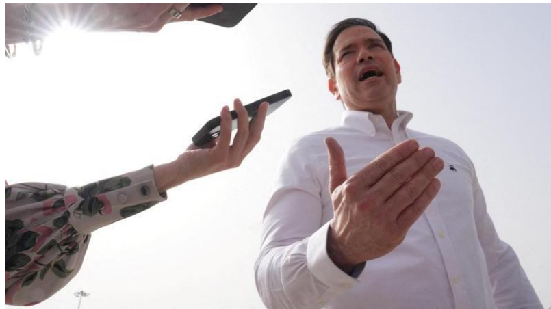
US Secretary of State Marco Rubio says there will either be a good agreement with Iran, or the US will deal with it in “another way”.

Iran’s foreign ministry spokesperson said conclusions had been reached on many topics discussed in a potential memorandum of un-