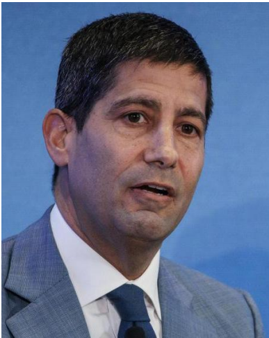
Former Fed governor Kevin Warsh is now a favourite to get the role of Fed chairman.