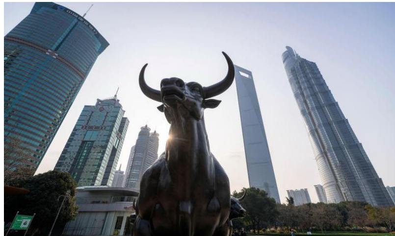
Thanks to fresh progress in sectors from commercial rockets to robotics and flying cars, Chinese tech shares have begun the new year with a bang

Since DeepSeek shocked global markets with its cheap and equally well-performing AI models on Jan 27 last year, fellow Chinese firms have accelerated efforts to develop their own versions. Adoption of generative AI has also surged among the country's Internet giants from Alibaba to Tencent.