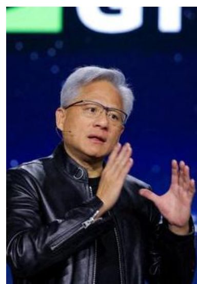
Nvidia CEO Jensen Huang has framed physical AI as the next wave after generative AI.

A representative for Samsung Electronics declined to comment in response to queries. Nanya said