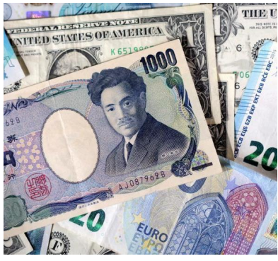
With Japan now in its Golden Week holiday, analysts speculate that officials could step in to support the yen again.

Two sources familiar with the matter told Reuters that officials had intervened to buy the yen on