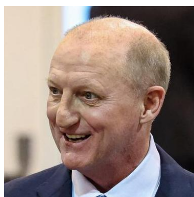
Berkshire Hathaway CEO Greg Abel at the firm's annual shareholders' meeting in Omaha, Nebraska, on May 1.

Buffett, for his part, assured the audience that "Greg is doing eve-