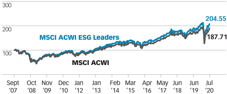
Relative performance of select MSCI ESG Indexes to MSCI ACWI Index