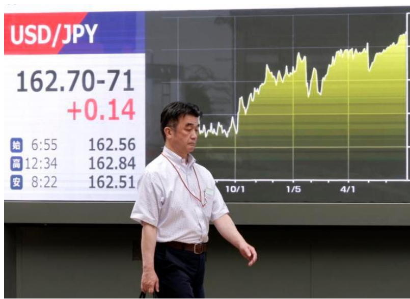
The yen found some support last week as traders grew wary of a possible shift in Japan's intervention strategy, though they said the currency's sudden jump was not indicative of official action.

US$1.1431, while sterling rose to a three-week high of US$1.3401 before easing slightly.