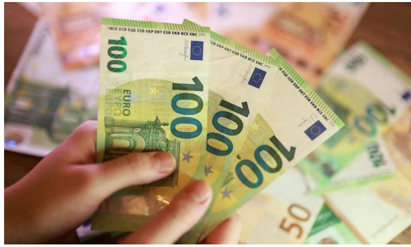
The euro is down 0.22% at US$1.1694.

The persistent yen weakness remains a source of concern for Tokyo. Earlier on Tuesday, Japanese Finance Minister Satoshi Katayama warned speculators again, saying that volatility in the crude oil futures market is affecting currency markets, adding that authorities are "standing by around the clock" to take "decisive action".