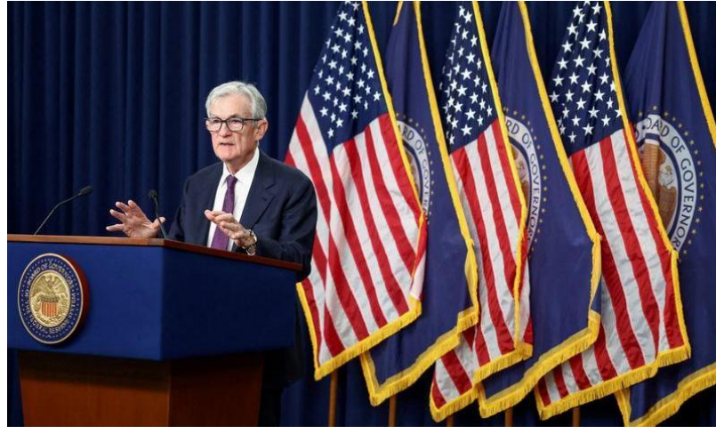
The Fed is widely expected to keep rates on hold, leaving the focus on policymakers' assessment of the war's impact on the economy and on Powell's (left) future.

Oil rose for an eighth straight day, the longest such stretch since May 2022, in the aftermath of Russia's invasion of Ukraine. The June contract that expires on Wednesday was up another 1 per cent at US$112 a barrel, while the most-active