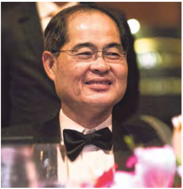
Guest-of-honour, Lim Hng Kiang, Minister for Trade and Industry, at his dinner table.