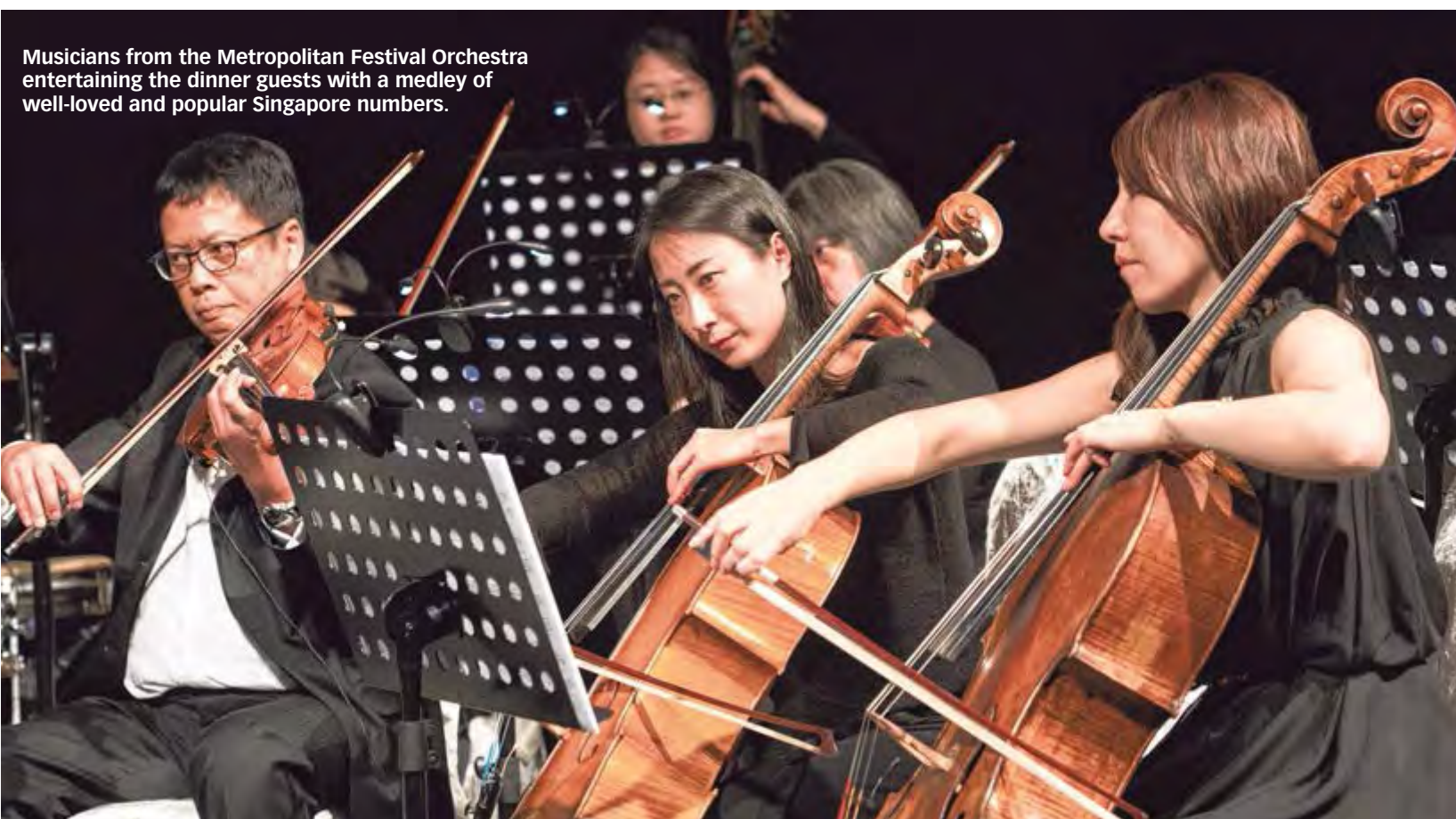
Musicians from the Metropolitan Festival Orchestra entertaining the dinner guests with a medley of well-loved and popular Singapore numbers.