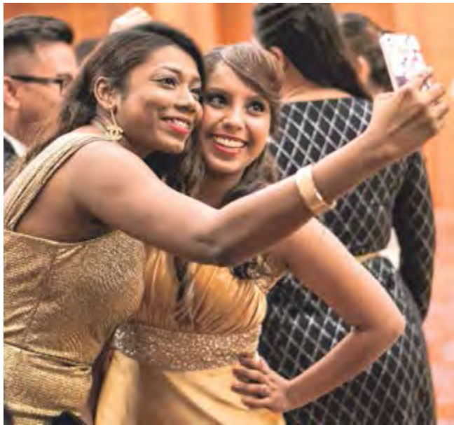
The golden girls: Ladies from DHL, decked out in gold outfits, taking wifies to remember the special evening.