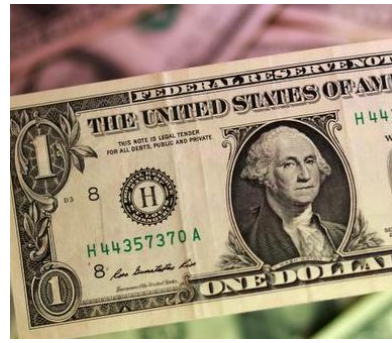
the CME FedWatch tool shows.

Investors are now pricing in a 48.5 per cent chance that the Fed could raise rates in December and a 98.8 per cent chance it keeps them on hold at its next meeting in June,