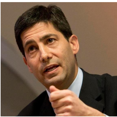
Warsh is seen as likely to support lower interest rates but would stop well short of the more aggressive easing associated with some of the other potential nominees.

THE US dollar gained on Friday (Jan 30) after former Federal Reserve Governor Kevin Warsh was selected to be the next Fed chair, and as the US currency recovered from a sharp selloff earlier in the week that analysts say was overdone in the short-term.