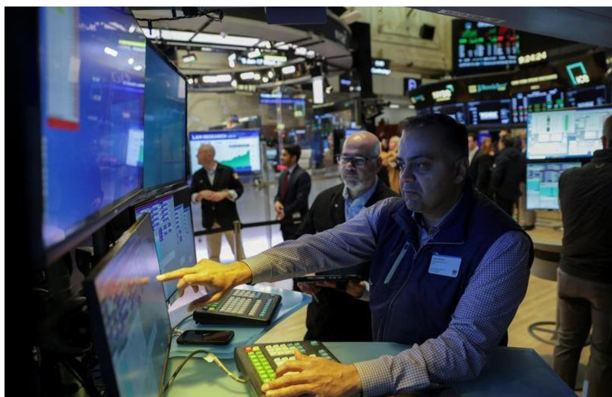
After a relentless rally, the US stock market has plateaued since the start of the year and started to slide when measured in other currencies.