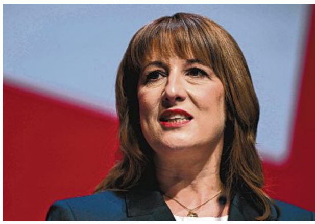
Investors are speculating whether Chancellor Rachel Reeves will be able to plug a spending hole estimated at around £35 billion.

Sterling is already up more than 7 per cent against a broadly weaker US dollar this year, but its gains have petered out since hitting a four-year high in early July. That's partly because the greenback has stabilised and partly because of in-