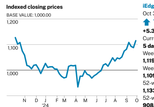
In a likely prelude to what may come, inflows into EM exchange-traded funds began to pick up towards the end of the third quarter.