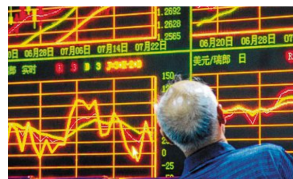
In a likely prelude to what may come, inflows into EM exchange-traded funds began to pick up towards the end of the third quarter.